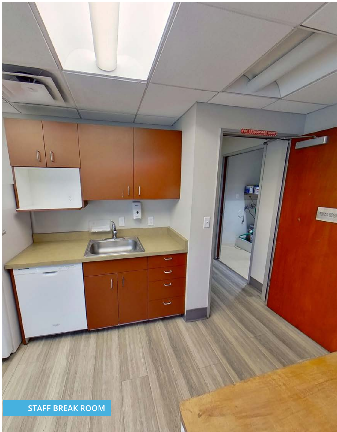
STAFF BREAK ROOM