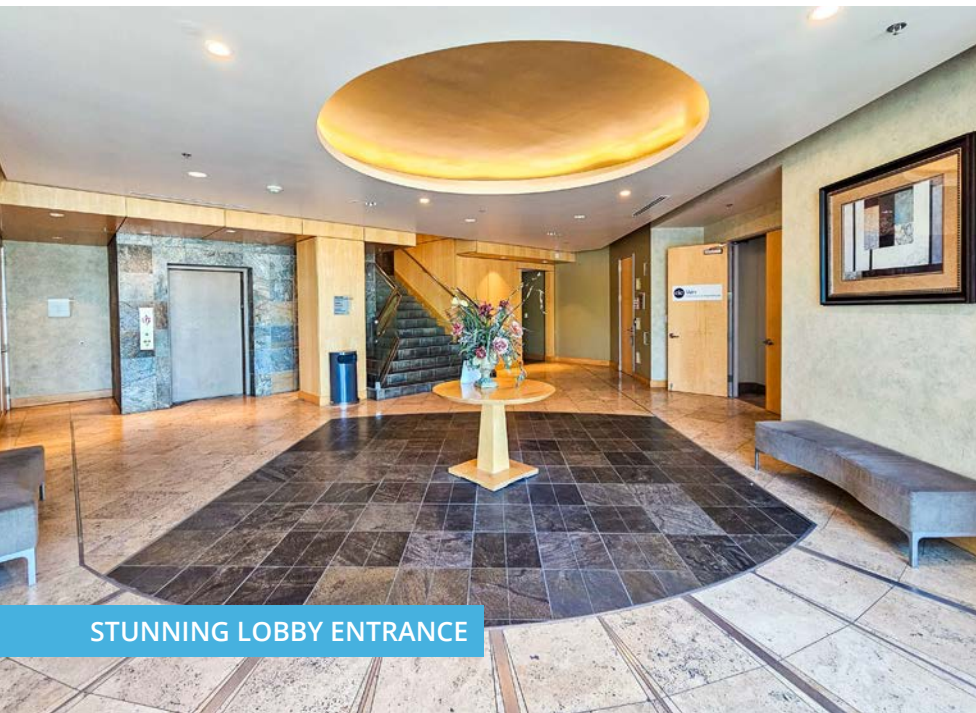
STUNNING LOBBY ENTRANCE