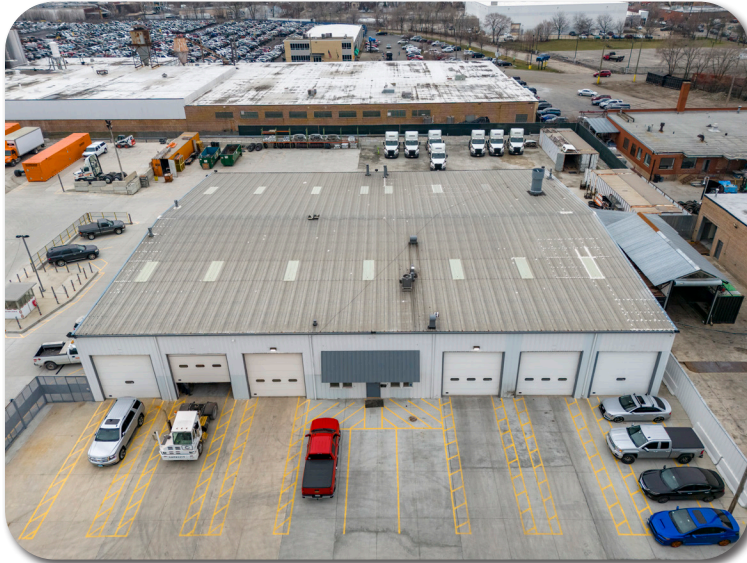
3106 S. Homan Avenue