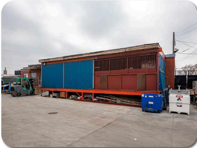
3100 S. Homan Avenue