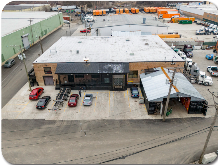
3104 S. Homan Avenue