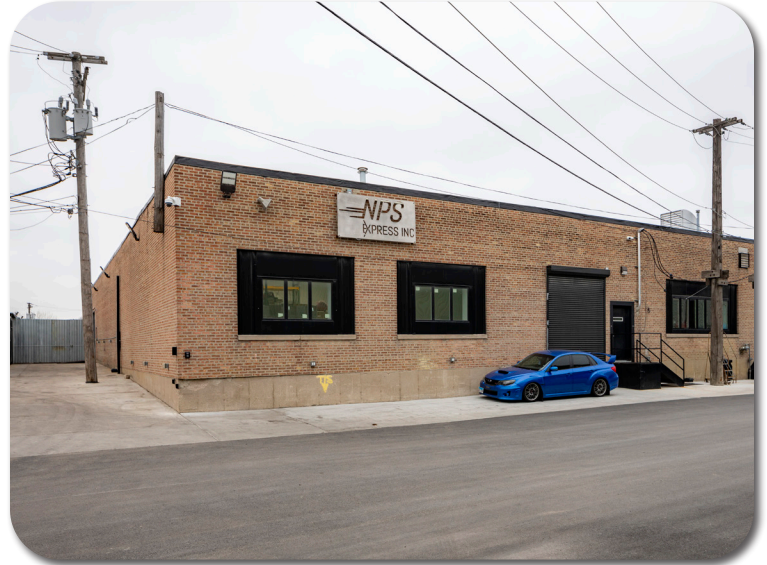
3104 S. Homan Avenue