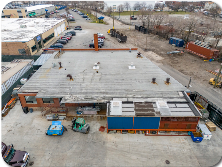
3100 S. Homan Avenue