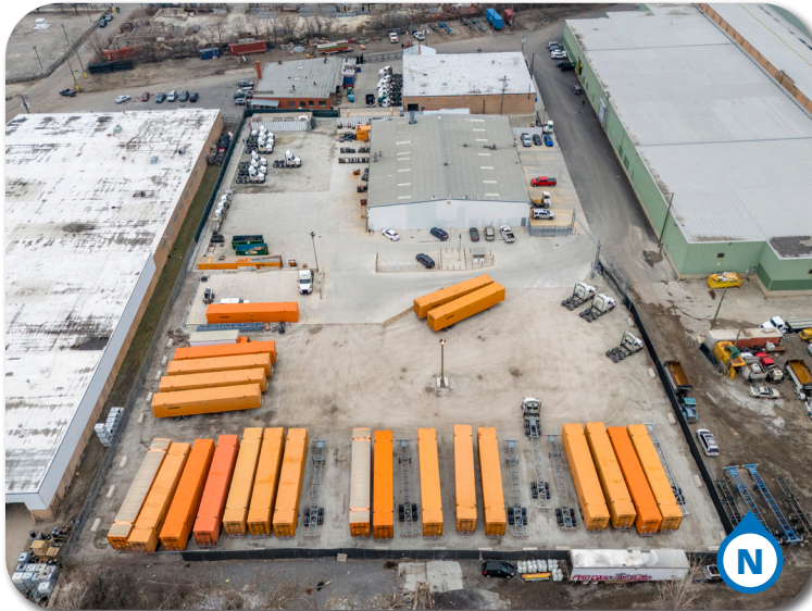
3100-3104 & 3106 S. Homan Avenue