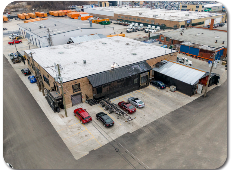
3104 S. Homan Avenue