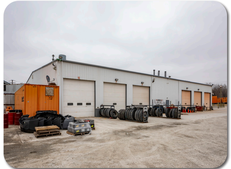
3106 S. Homan Avenue