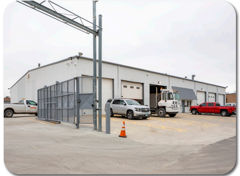
3106 S. Homan Avenue