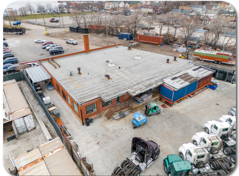
3100 S. Homan Avenue