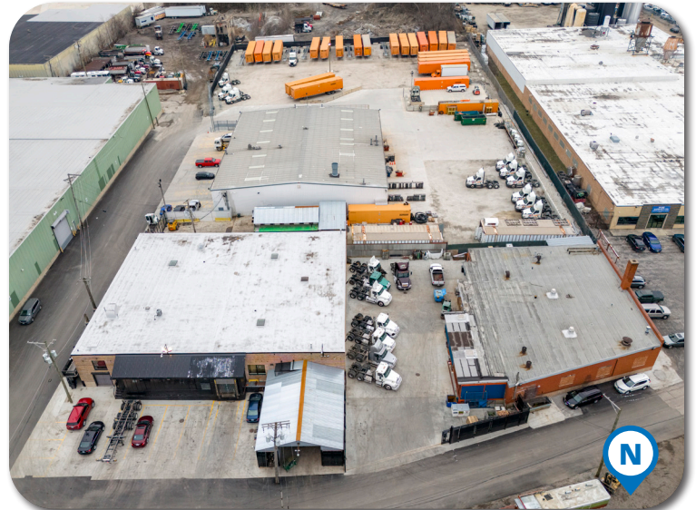
3100-3104 & 3106 S. Homan Avenue