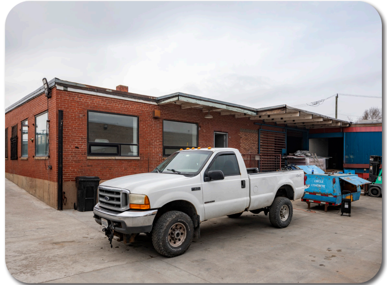
3100 S. Homan Avenue