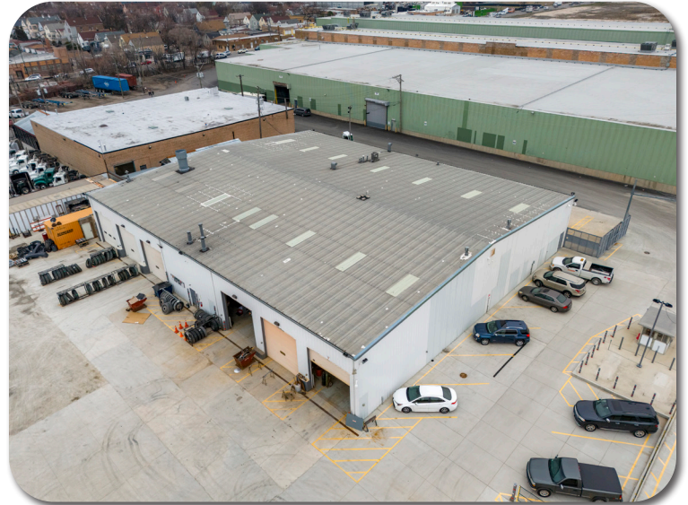
3106 S. Homan Avenue