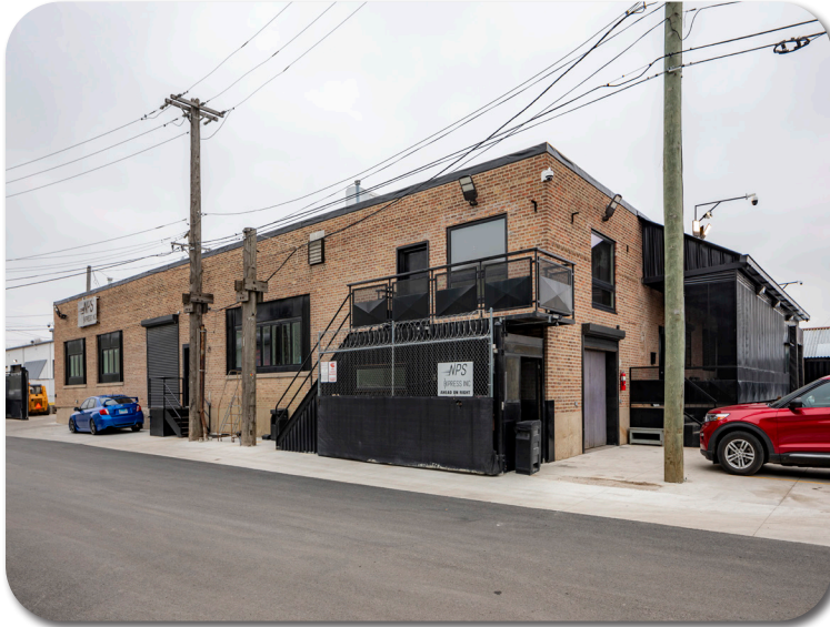
3104 S. Homan Avenue