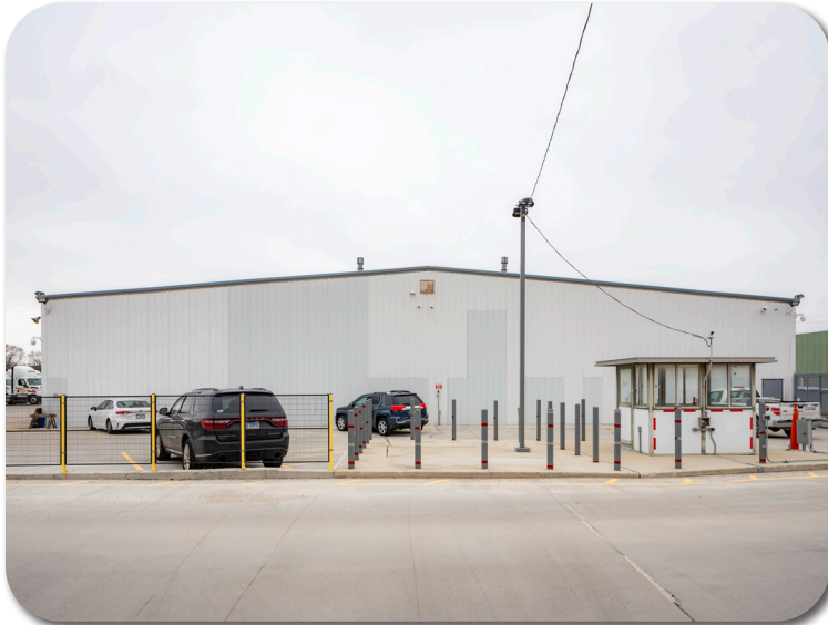
3106 S. Homan Avenue