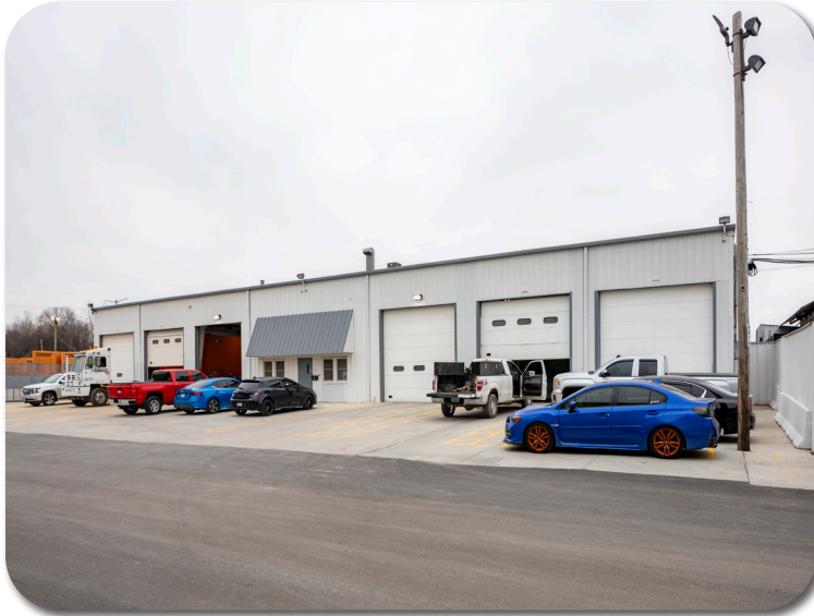
3106 S. Homan Avenue