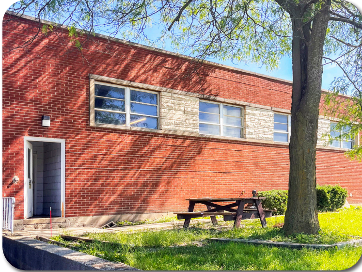
Front Southwest Outdoor Area