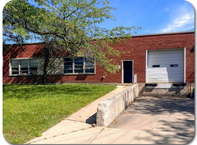
Front Southeast Loading Dock