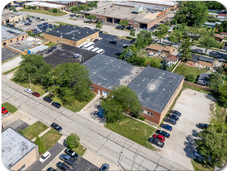
Southeast Bird's Eye View