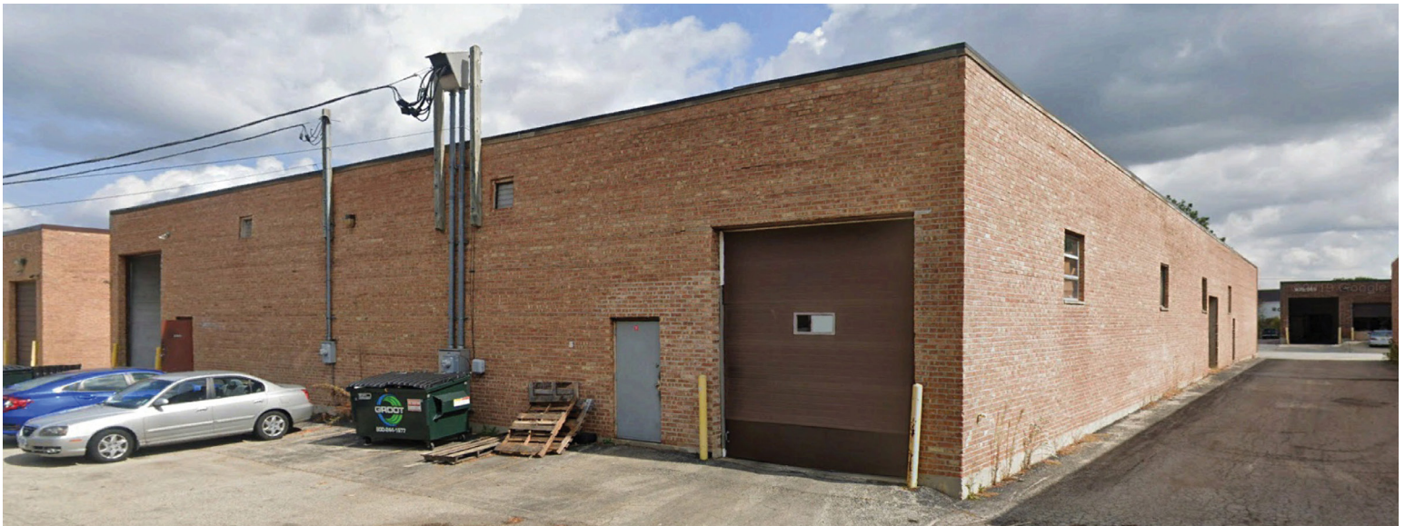
UNIT 810 DRIVE-IN DOOR