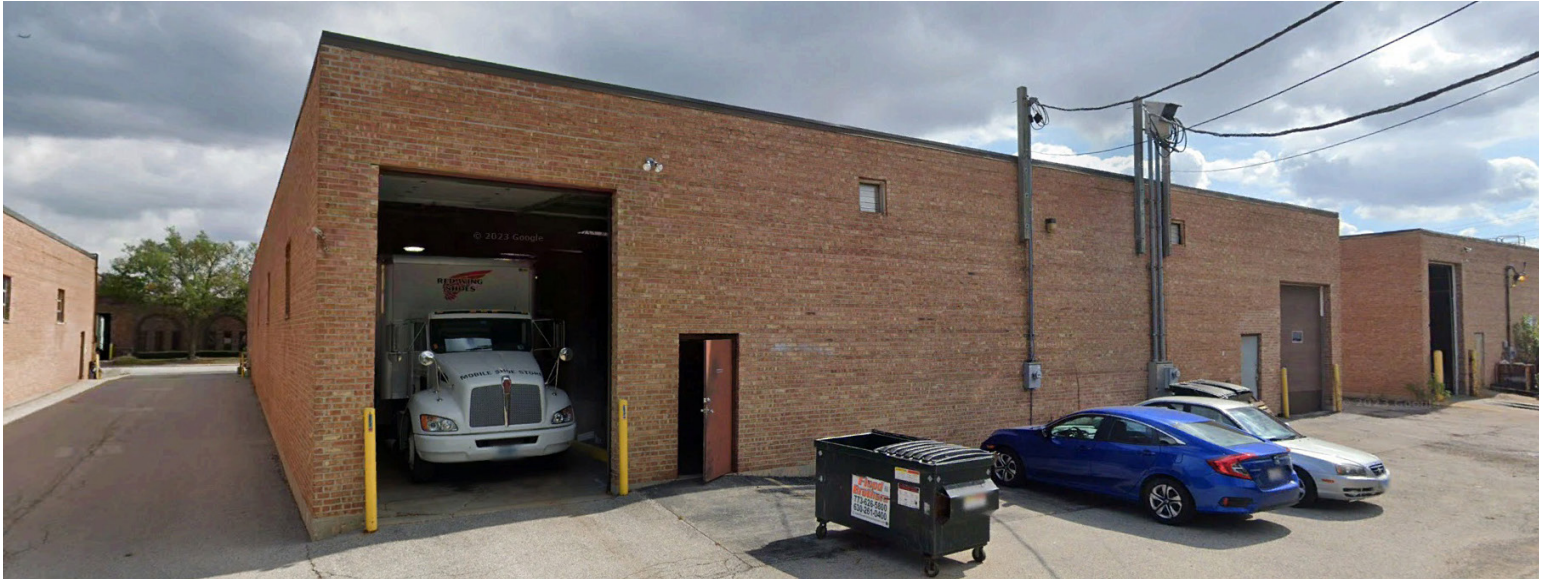
UNIT 800 DRIVE-IN DOOR