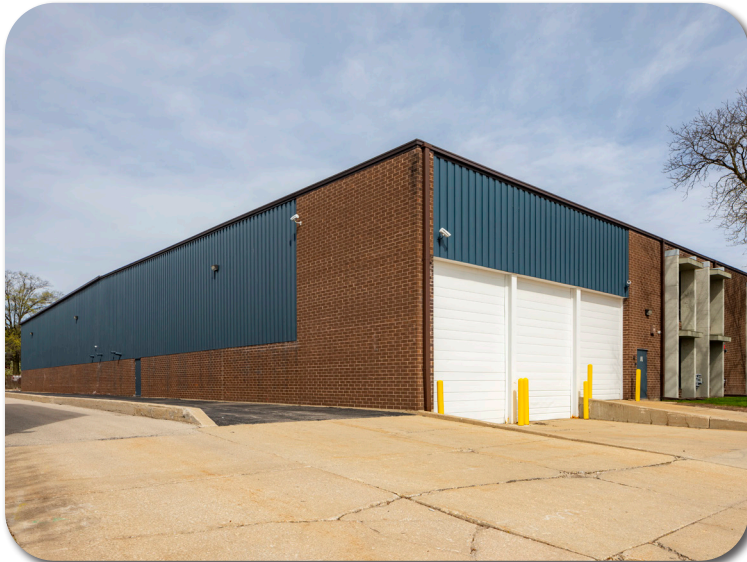
Loading View (SE Corner)