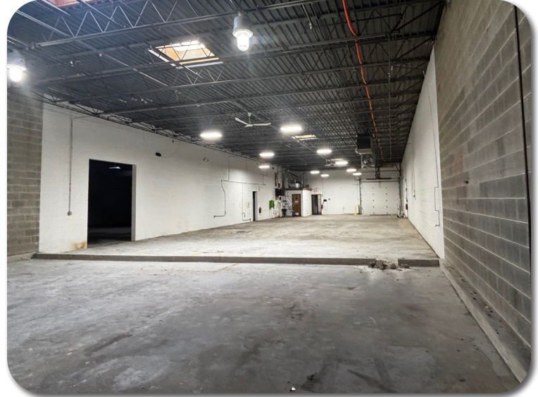
Unit 296 Warehouse