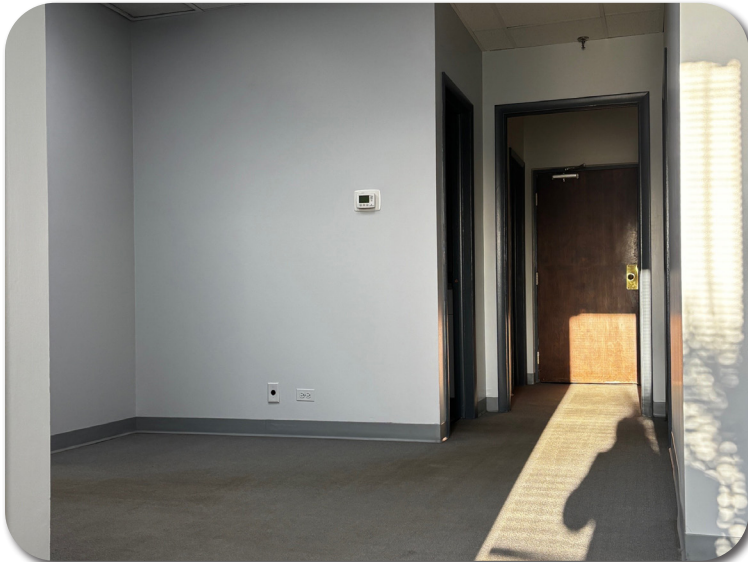
Unit 294 Office