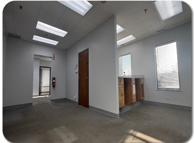
Unit 296 Office