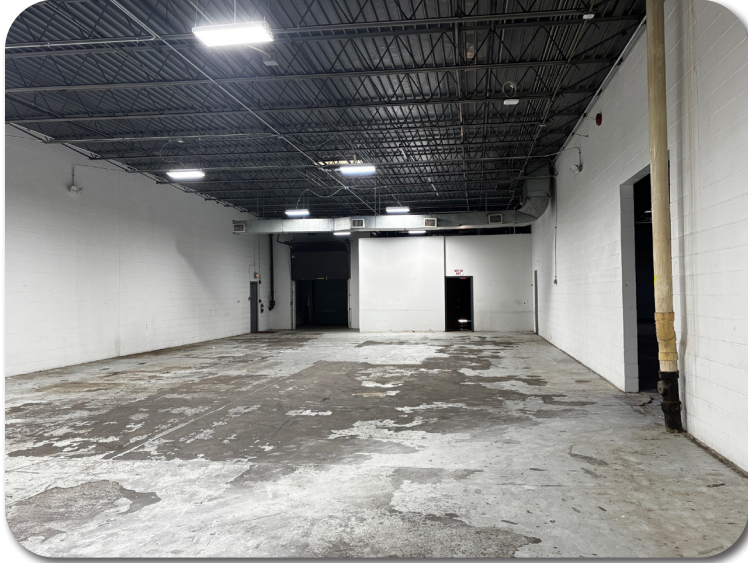
Unit 294 Warehouse