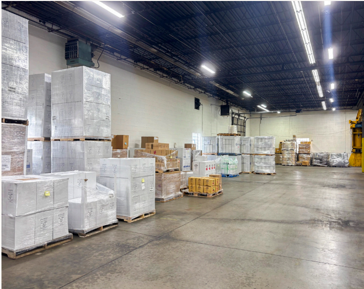
WAREHOUSE RECENTLY UPDATED

300 Laura Dr, Addison, IL 60101 Property Website