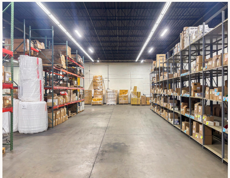
WAREHOUSE RECENTLY UPDATED