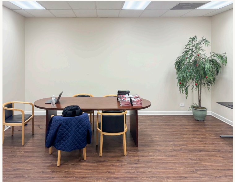
TEAM ROOM RECENTLY UPDATED