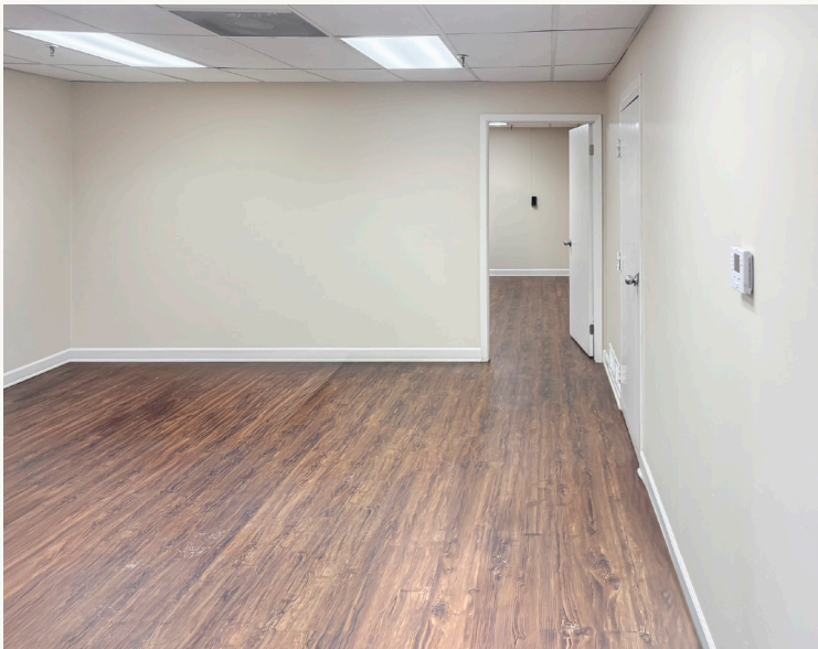
OFFICE RECENTLY UPDATED