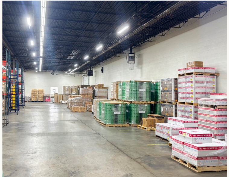
WAREHOUSE RECENTLY UPDATED