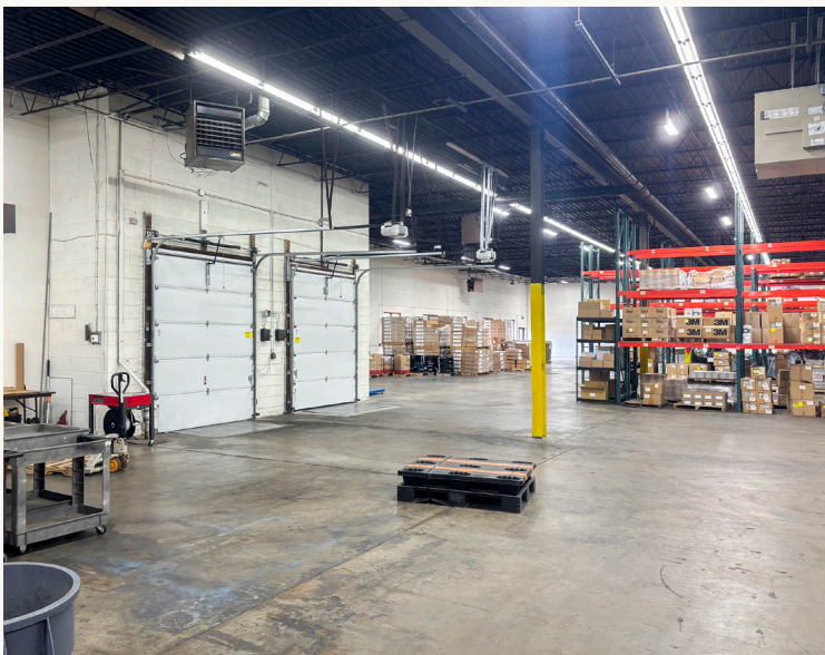
WAREHOUSE LOADING AREA