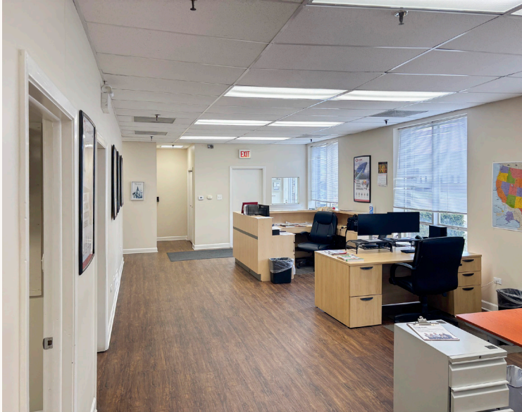
OFFICE RECENTLY UPDATED

300 Laura Dr, Addison, IL 60101 Property Website