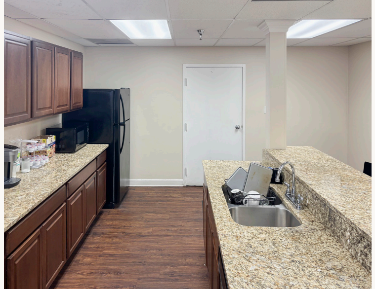
BREAK ROOM RECENTLY UPDATED