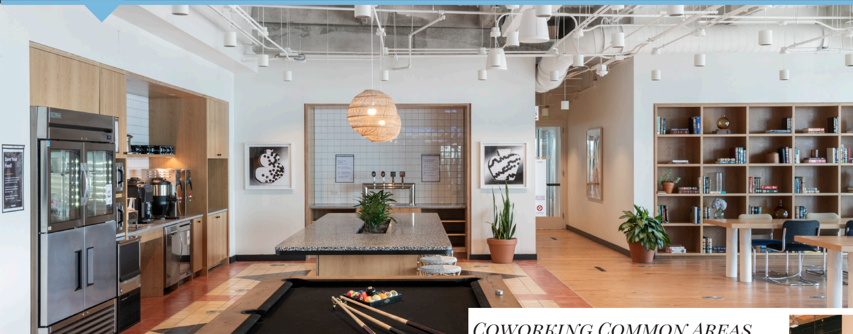
PROFESSIONAL & SOCIAL EVENTS