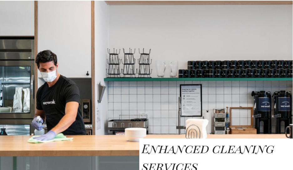
ENHANCED CLEANING SERVICES