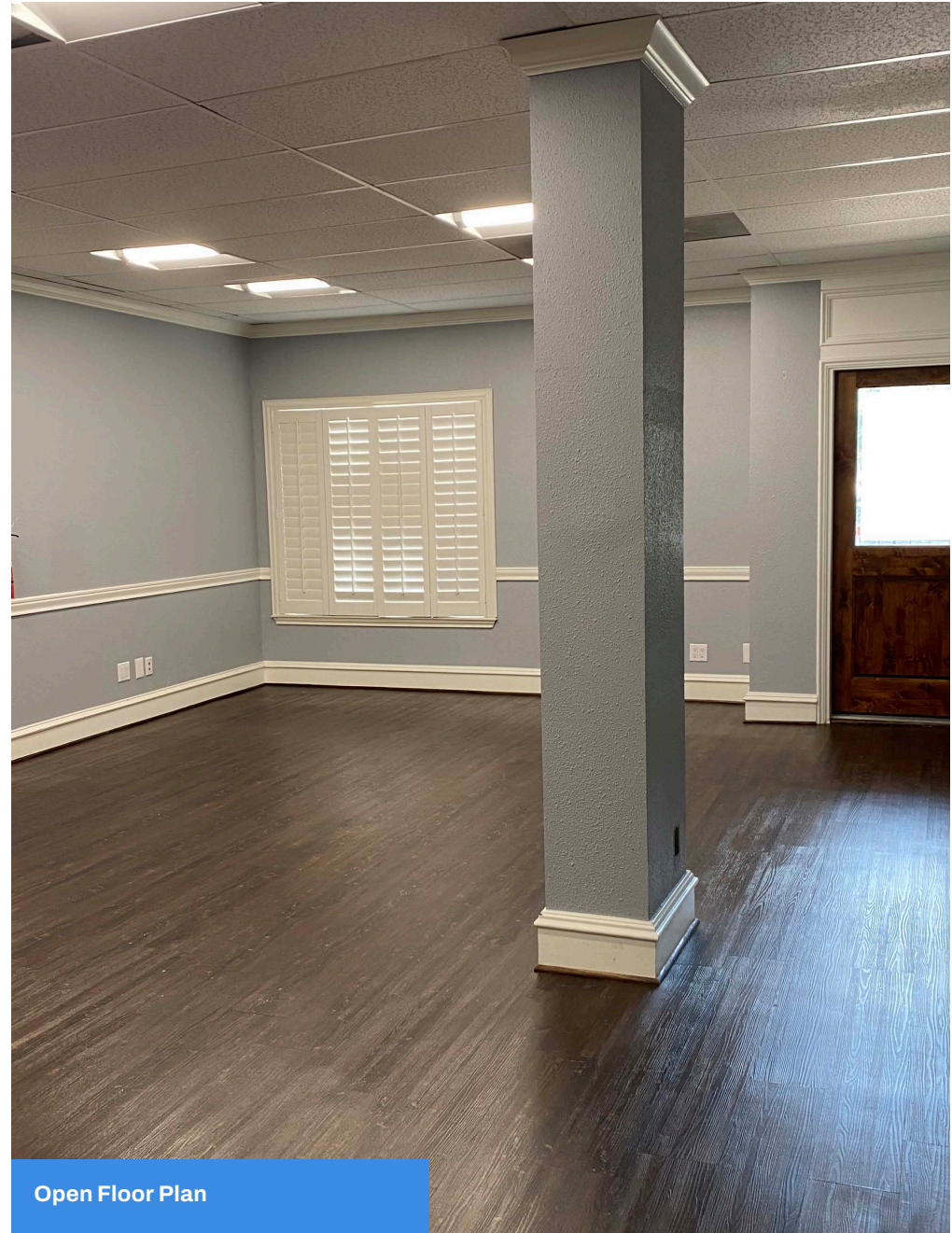
Open Floor Plan