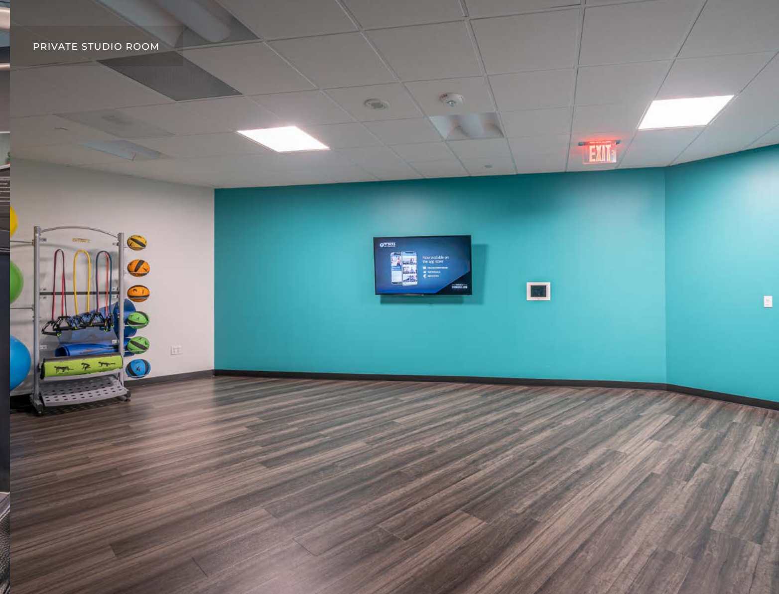
PRIVATE STUDIO ROOM