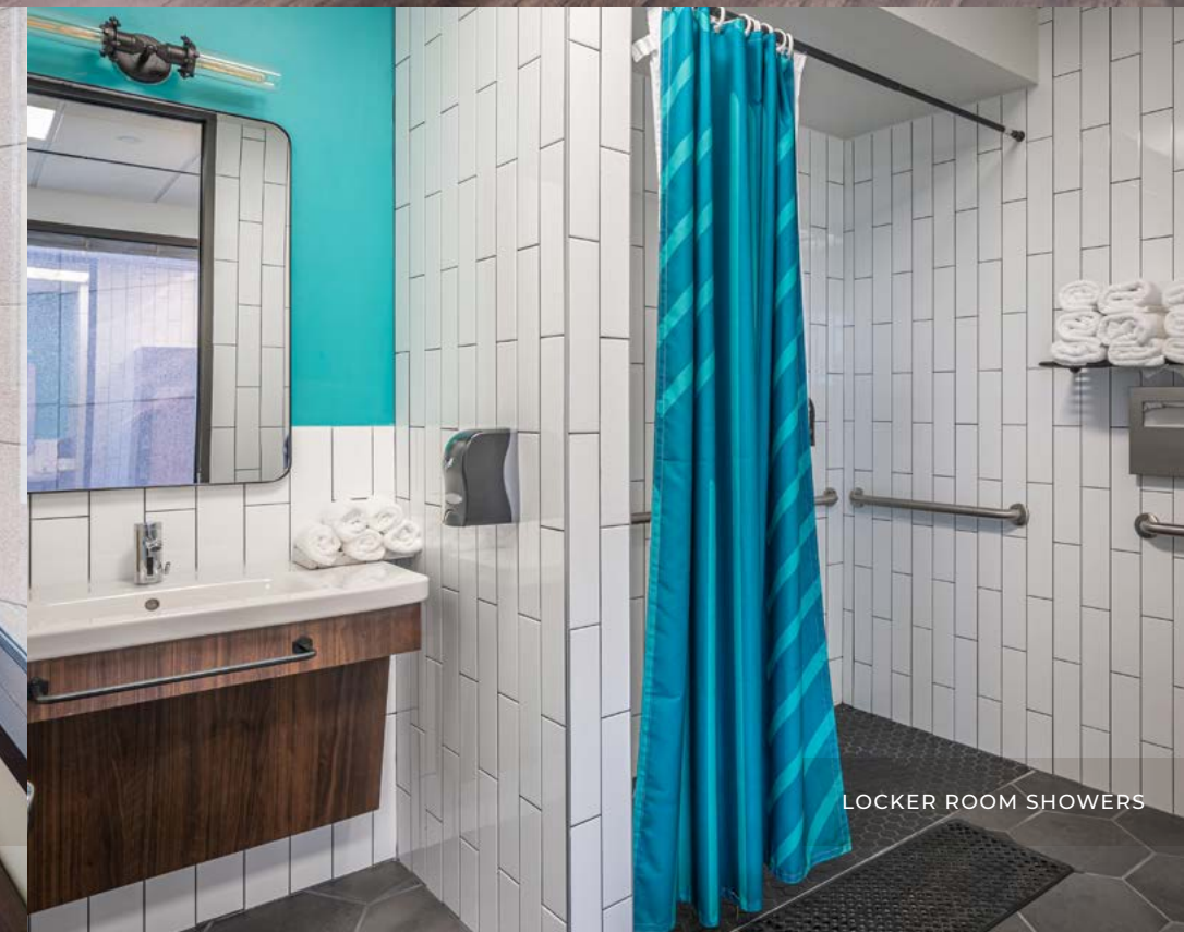
LOCKER ROOM SHOWERS