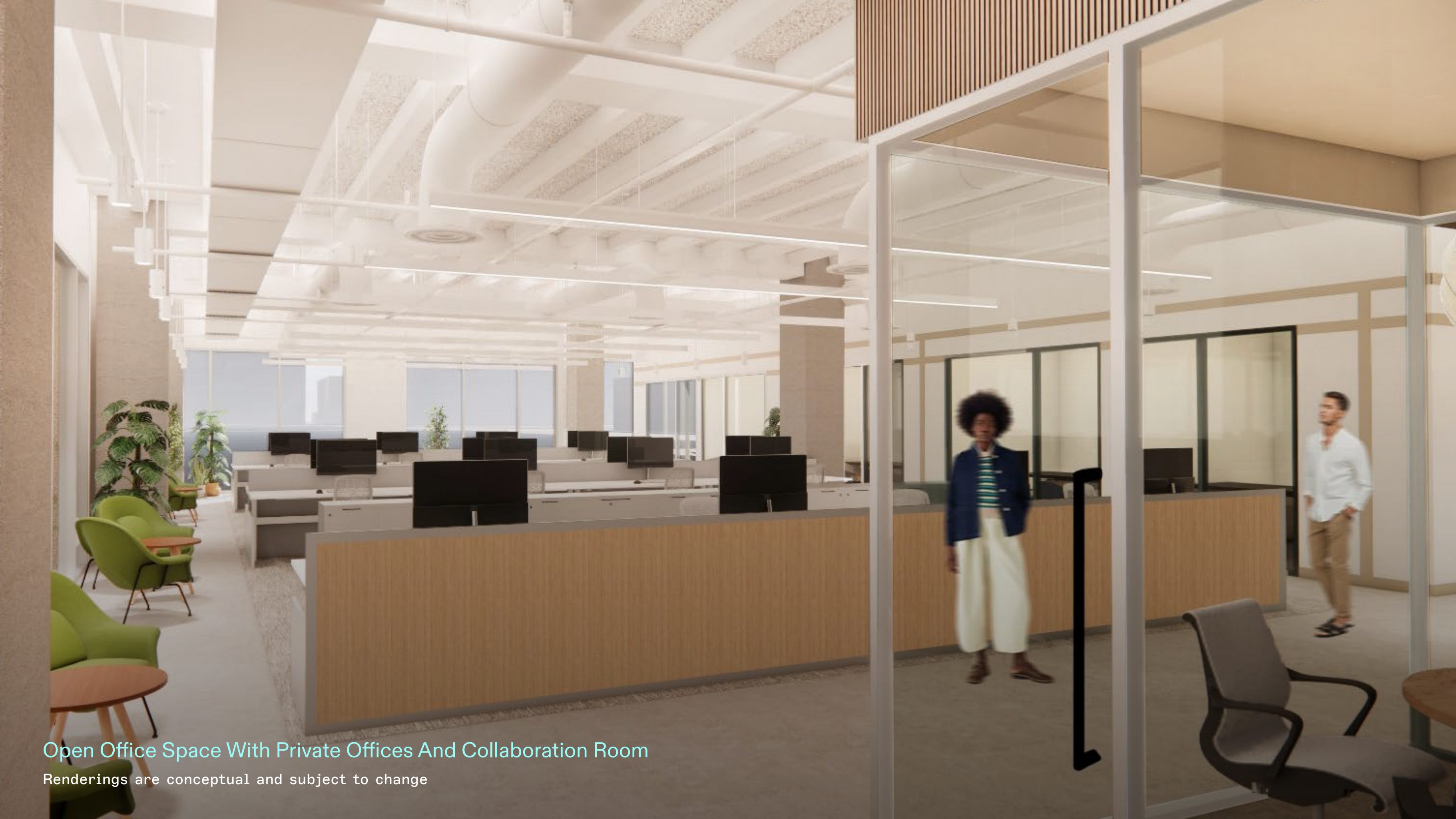
Open Office Space With Private Offices And Collaboration Room

Renderings are conceptual and subject to change