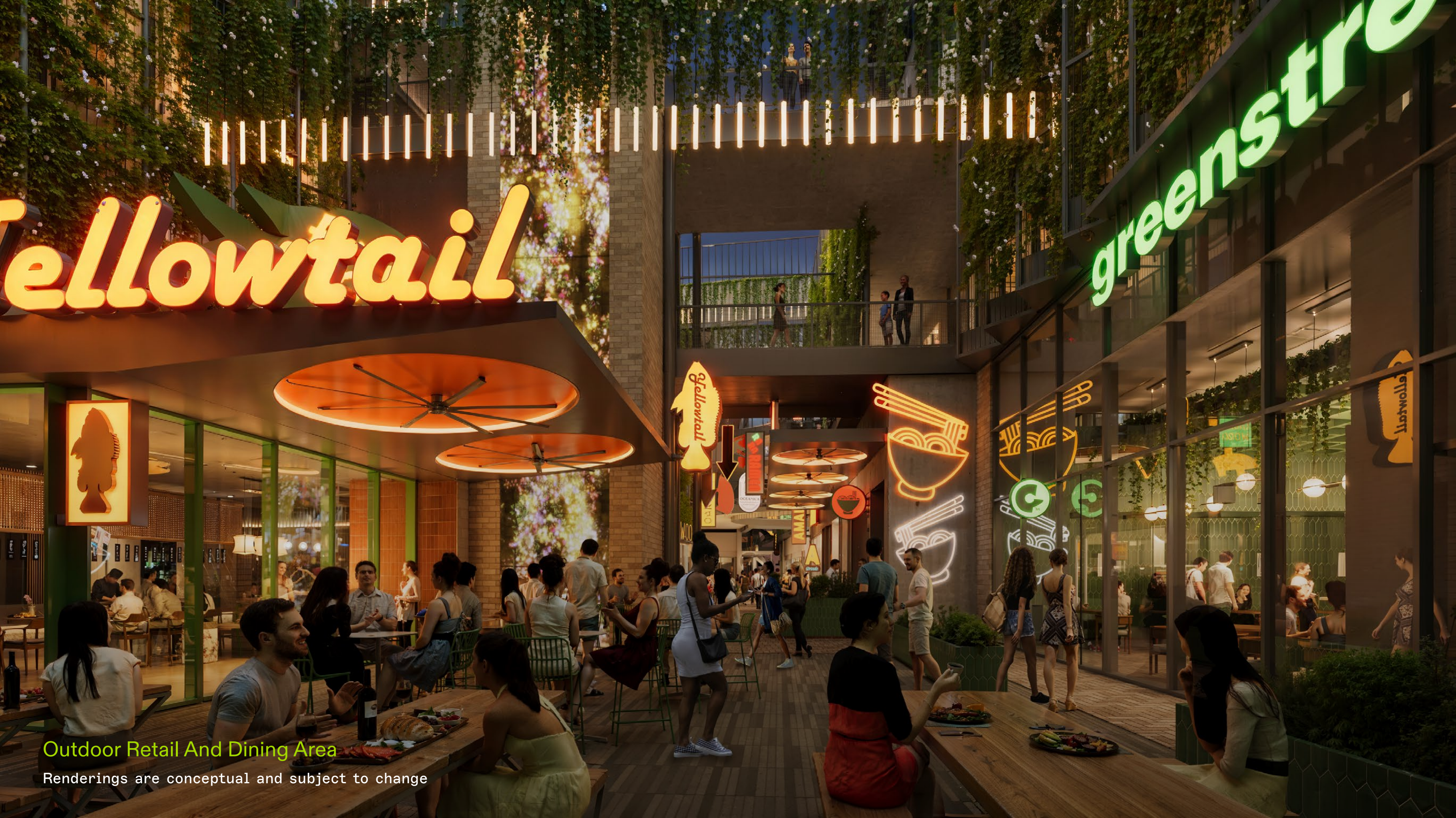
Outdoor Retail And Dining Area

Renderings are conceptual and subject to change