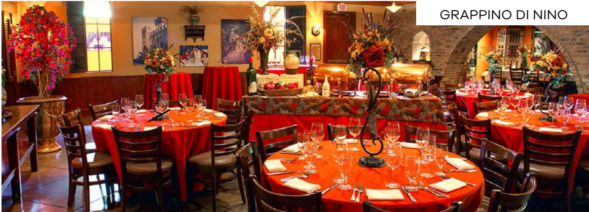
GRAPPINO DI NINO