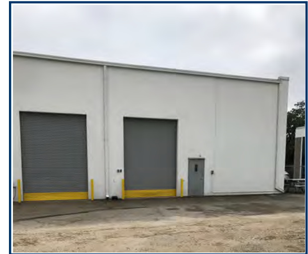
Grade Level Doors to Warehouse