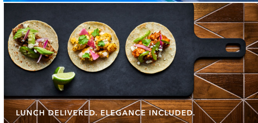
LUNCH DELIVERED. ELEGANCE INCLUDED.

NO CIRCLING. JUST CURBSIDE CLASS FOR CLIENTS