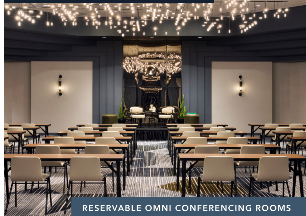
RESERVABLE OMNI CONFERENCE ROOMS