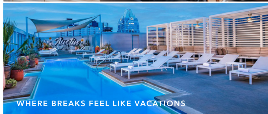
WHERE BREAKS FEEL LIKE VACATIONS