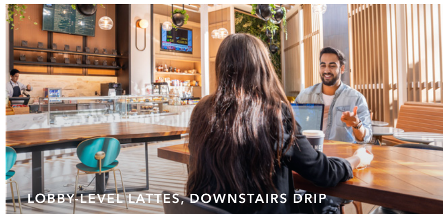
LOBBY-LEVEL LATTES, DOWNSTAIRS DRIP