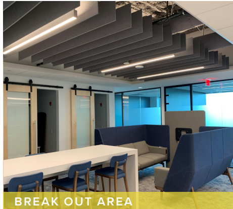
BREAK OUT AREA